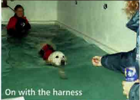
On with the harness