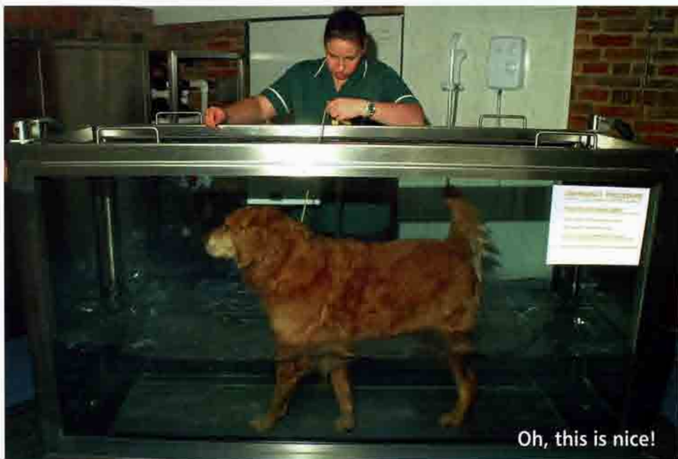
Oh, this is nice!

Her efforts were recognised in 2000 when she was awarded the title, Coventry and Warwickshire Businesswoman of the Year 2000, her business being the first kennels, cattery and hydro pool in the Midlands and only one of four in the country to have achieved the accolade of Investor in People certification.