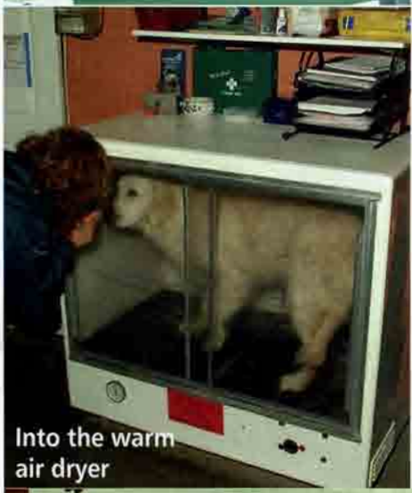
Into the warm air dryer