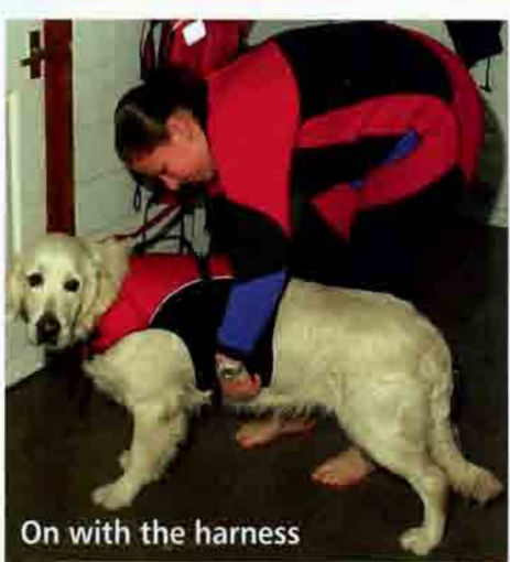
On with the harness