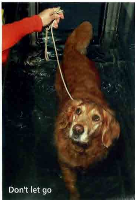
Don't let go

Building the hydrotherapy centre was an important addition to her home and kennels - and is something that she is delighted to have gone ahead with. Recently she has added an underwater treadmill to her facilities, which is also proving very beneficial for a whole range of canine ailments.